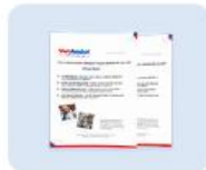
Next Step Flyer