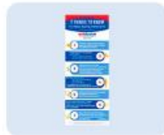
7 Things You Need To Know Infographic